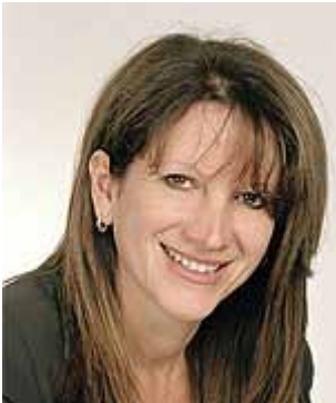
Rt. Hon. Theresa May MP Home Secretary and Minister for Women and Equalities

A handwritten signature in black ink, appearing to read 'Lynne Featherstone'.